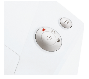
The full bin is indicated via the display and the machine switches off automatically.

The induction-hardened, solid steel cutting rollers guarantee durability.