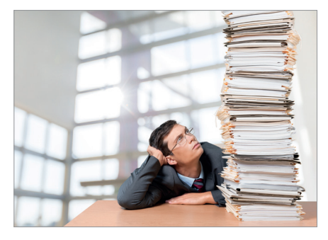
For continuous operation

The powerful motor ensures a high cutting capacity and reliable continuous operation.